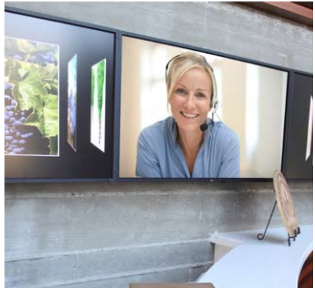
Virtual Reception Desk